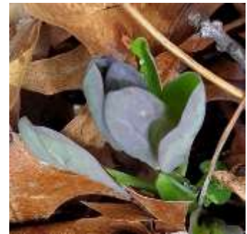
Virginia Blue- Bell Sprouting

Spring is also known as the time for rebirth. In nature we see plants sprouting up and baby animals peeking out. Adult animals will be shedding winter coats and plumage. It's a good time to take a walk-on-the-wildside and explore the regeneration taking place. In the next few weeks spring wildflowers will begin sprouting up and blooming in the Woodlawn woods. Humans will be storing away heavy clothing and begin enjoying more outdoor time. Humans may also begin working on starting floral and food gardens. At Nature Center, we have supplies out for visitors to start some native wildflower or food plant seeds.