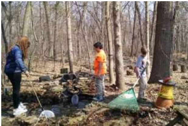
Elkhart Elementary Academy students exploring and cleaning out the waterfall pond

Certainly our plan will be evolving as we work through initiating projects with consideration of member and community input. WNC is committed to continue providing our “Haven in the City” for the Elkhart area community. We look forward to new adventures as we Discover, Experience, & Learn together.