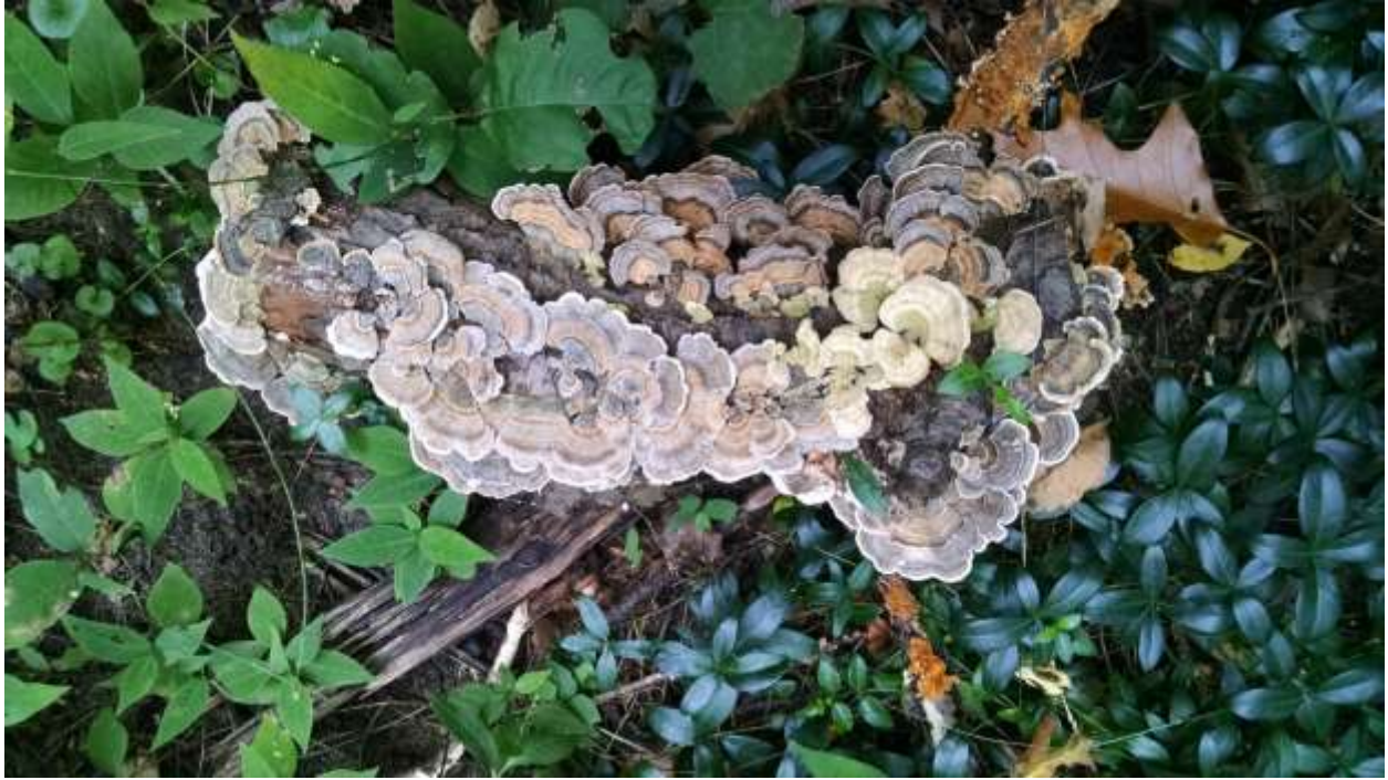
Turkey Tail Fungus