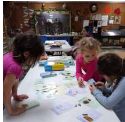
Learning Rock Identification during Wild Wednesdays