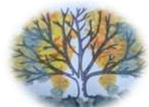
Reverse printing during Wild Wednesdays

Certainly our plan will be evolving as we work through initiating projects with consideration of member and community input. WNC is committed to continue providing our “Haven in the City” for the Elkhart area community. We look forward to new adventures as we Discover, Experience, & Learn together.